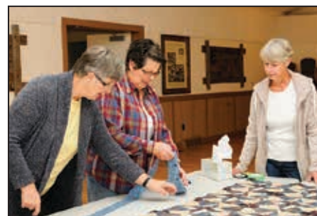
Group members arrange a fabric design at a quilting bee.