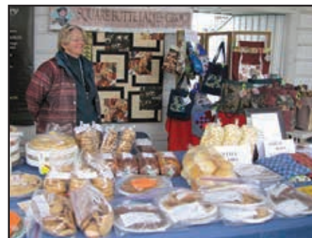
Selling their wares at the Millarville Farmers' Market.