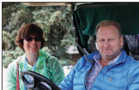
Volunteers from the DDRC help out around the golf course at the 2015 tournament.