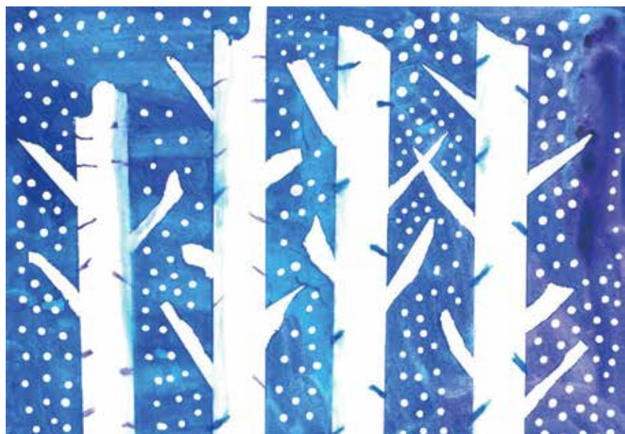
Winter Birch Trees